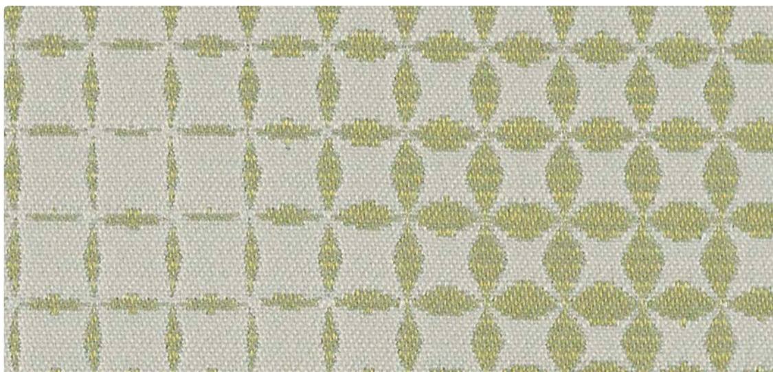
CZ973-003 Green Tea

Reduced Environmental Impact GREENGUARD Gold Certified