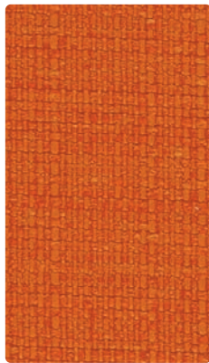
WC751-009 Orange Peel