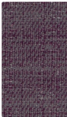
WC751-005 Purple Haze