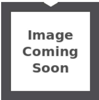
Obsession Collated Set (8) WC752CL