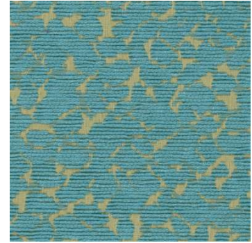
Water Lily WC752-004