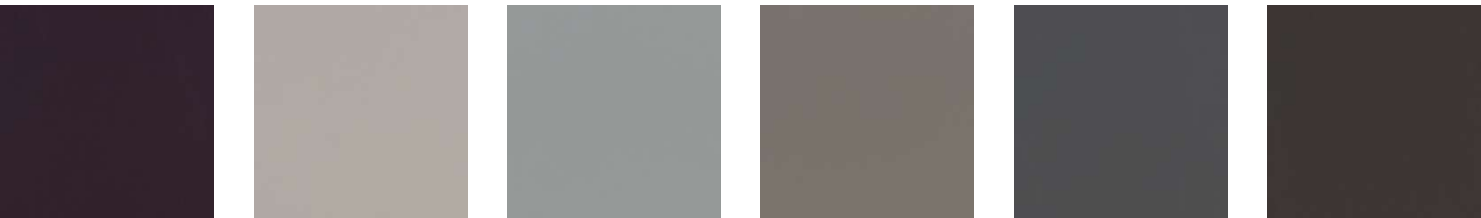
Regal PS-005 Pumice PS-006 Tin PS-016 Flint PS-026 Steel PS-036 Hearth PS-046