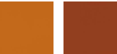
Tangerine PS-009 Turmeric PS-019