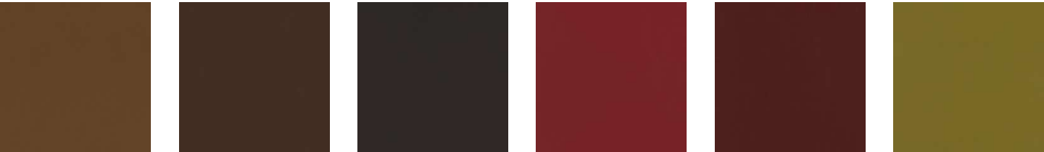
Coffee PS-000 Chocolate PS-010 Mahogany PS-020 Sangria PS-001 Brick PS-011 Celery PS-003