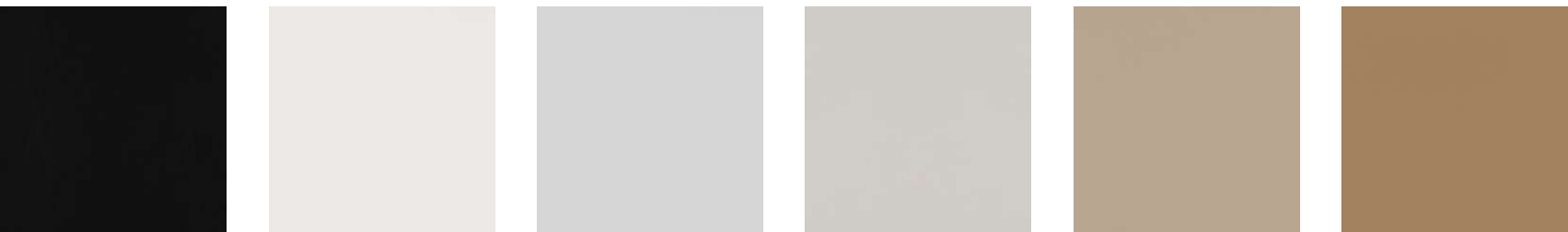
Night PS-056 Snow PS-007 Glacier PS-017 Alabaster PS-027 Sand PS-037 Wheat PS-047