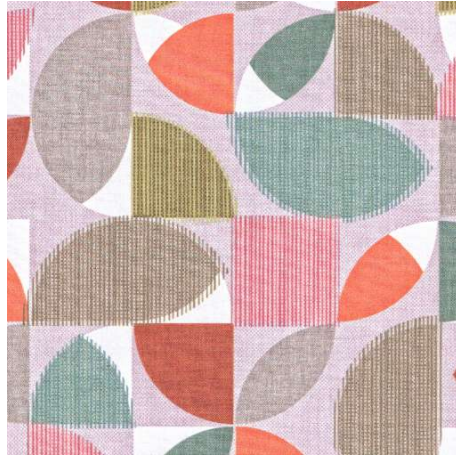
Rose Quartz CR-001