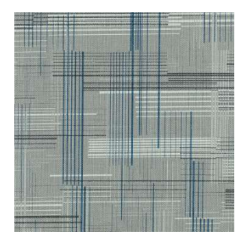
Grey Mist BA-026