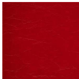
Old Glory AQ-001